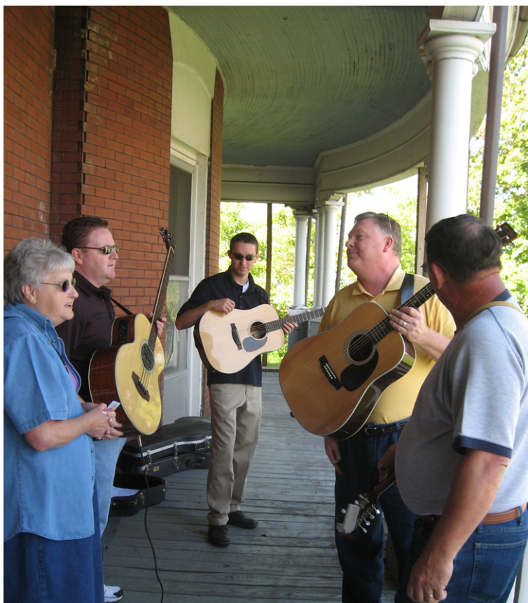
The Bluegrass Band “Hart Creek” (left) entertained visitors to the E.W. King House during September’s Open House held in conjunction with Bristol’s Rhythm & Roots Festival