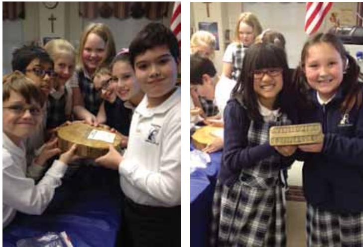
St Anne's students enjoy looking at a piece of the Pemberton Oak and other Bristol memorabilia during Bristol History classes.

The Education Committee is a vital part of the Bristol Historical Association. Volunteers go into elementary schools with a power point presentation telling the story of Bristol. Letters have gone out to all schools including Sullins, St. Anne's, the Morrison School, and Homeschoolers. Fourth grade students are targeted.