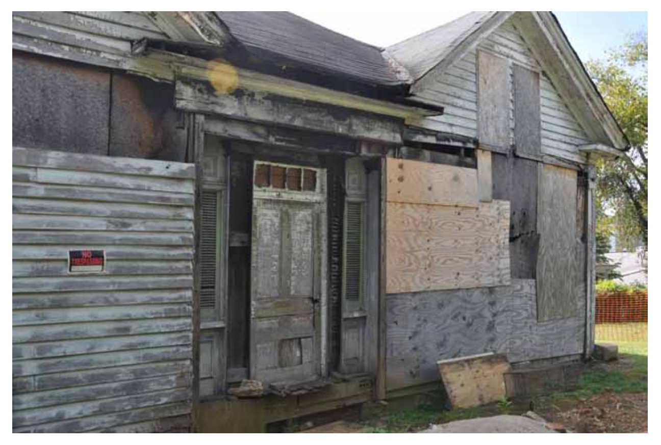
Picture #2 is a current view of the back side of the house. I have not done any work on it. There are two windows that were removed when the addition was put on back in the early 1920s that will have to be built and installed.